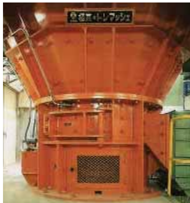
Kyokuto-Tremache Type-58 Pulverizer

An unwanted material that is put into the equipment from the upper side is roughly crushed while the unwanted material free-falls through the conical section. Foreign substances that cannot be crushed are automatically eliminated from the rejection opening. The unwanted material is finely pulverized in the choker ring section, where the space between the hammer and inner wall is narrowest. The unwanted material is further pulverized between the hammer and body liner on the bottom part of the equipment and discharged from the outlet. Wastes put into the upper side are pulverized in steps, thus not requiring a supply feeder for the volumetric feeding, prior crushing, and capacity reduction of the wastes.