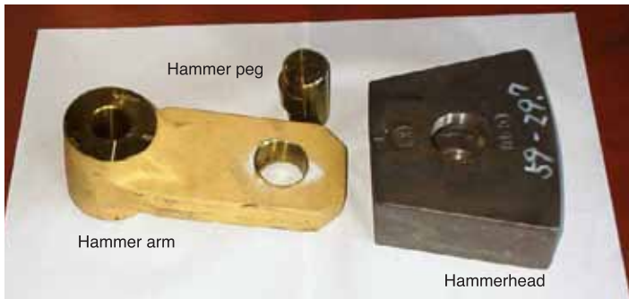
Hammer Assembly of Type-58 Pulverizer