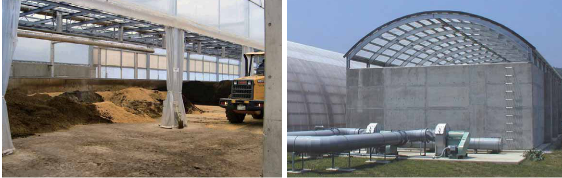
Rock wool deodorizer