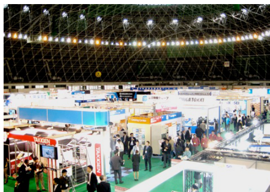
A bird's eye view of the exhibition hall

The Biwako Environmental Business Exhibition is an annual exhibition started in 1998, and aims to create a sustainable economic society and boost environmental businesses under its basic philosophy of 'the mutual benefit of the environment and economy.' The exhibition is exclusively held to offer opportunities for active BtoB negotiations between exhibitors and visitors, and is drawing attention in both Japan and abroad. 'Biwako Environmental Business Exhibition 2015' offers opportunities for acquiring new customers and expanding sales. The participation of companies and organizations engaged in environmental businesses both as exhibitors and visitors is welcomed.