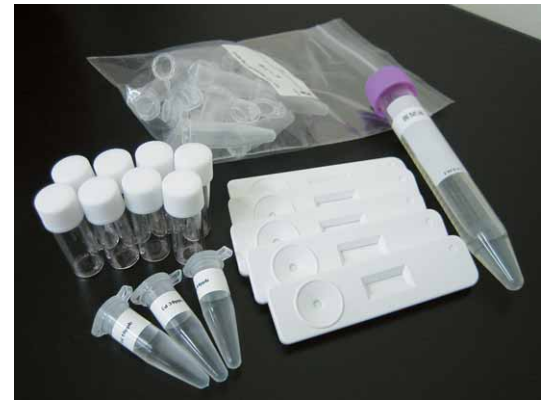
Cd assay kit (Cadmierre)