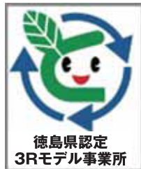
Tokushima Prefecture certified 3R model business mark

The certification program recognizes the following: