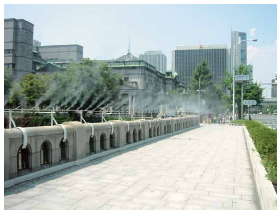
Dry misting using water that has been treated by advanced purification (Yodoyabashi Bridge)

◎ It has been confirmed that water misting programs can reduce energy consumption by air conditioning systems in residential and other areas, and the use of such safe water that has been treated by advanced purification allows these programs to provide both cooling and comfort with peace of mind.