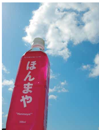
"Honmaya" bottled water is treated by advanced purification by the Osaka Municipal Waterworks Bureau.

◎ Thanks to the use of advanced purification technologies, the City of Osaka is able to supply safe tap water through high-level purification and water quality management that completely eliminates stale smells and other unpleasant odors and tastes. "Honmaya" brand bottled water, which is manufactured using the same advanced purification process, is widely regarded as being of the same quality as mineral water.